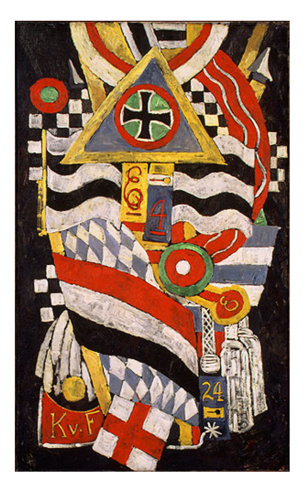
Portrait of a German Officer, 1914

in 1912 and Berlin from 1913 – 1916. He painted images of German military pageantry until WWI changed his views, believing that war was no longer 'a romantic but a real reality'.